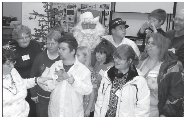
December 11 gathering in Oregon