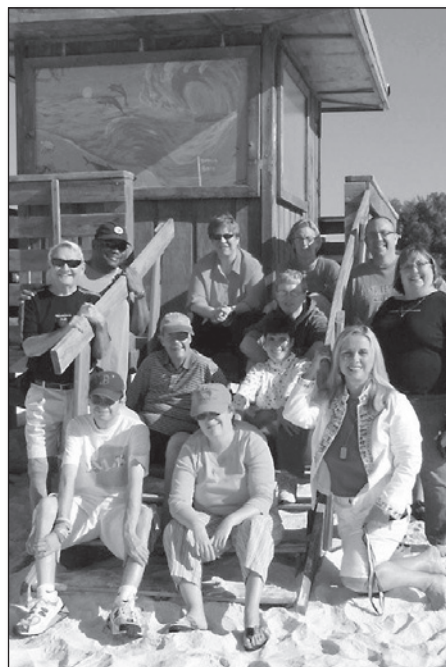
Advisory Board taking a well-deserved and fun break at the beach

fundraising campaign being developed by PWSA (USA) for May of 2011. While the agenda was full, Advisory Board members did take a brief break to visit the world famous Mote Marine Aquarium in Sarasota on Saturday afternoon. ■