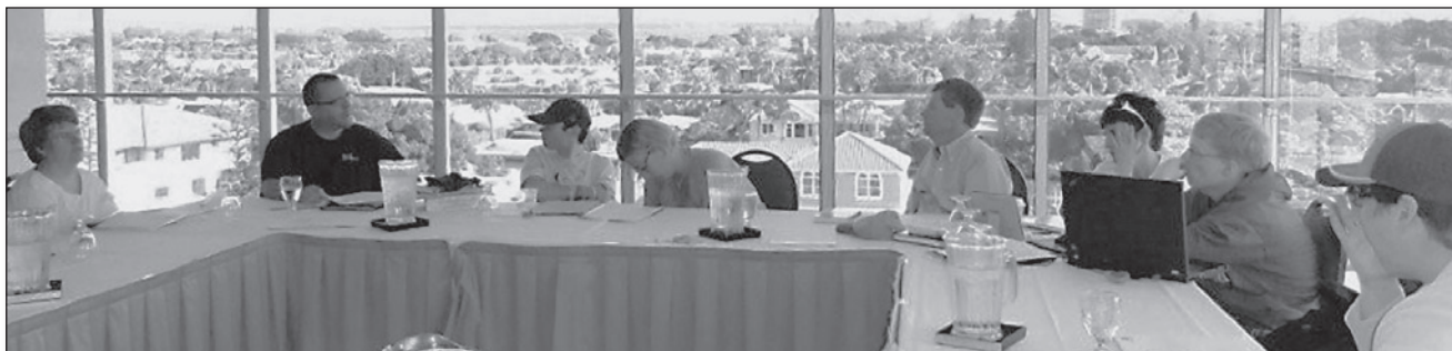
Advisory Board working with PWS leaders at annual meeting