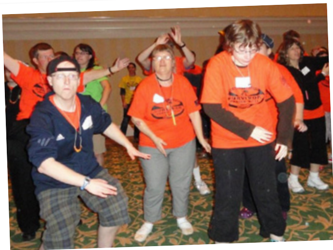
"Survivor" tribes in their colorful T-shirts perform for closing ceremonies