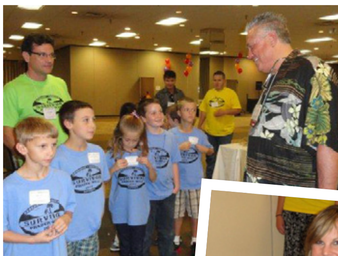
Clint Hurdle, Keynote speaker with "Survivor" tribe.