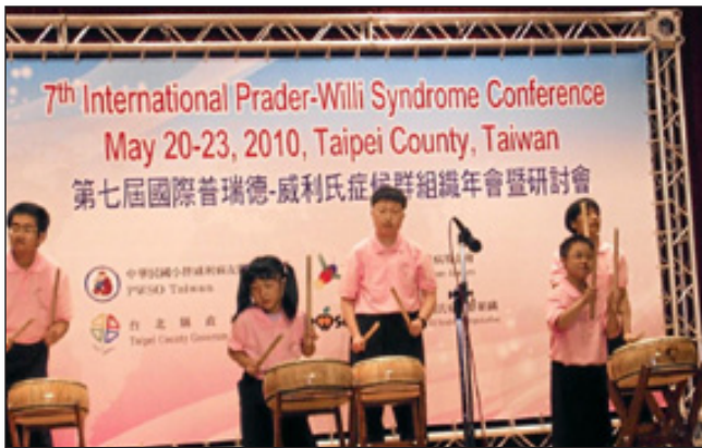
Children from Taiwan with PWS drumming for the conference.

Highlights included the joy of families from countries with no awareness and support for PWS such as China and Cuba, meeting their first parent peers who knew the syndrome; beautiful musical performances by a choir of children who have rare diseases; charming volunteers who guided us every step of the way, even in the subways; fascinating food including two western luncheons provided by Burger King; dozens of enormous pink flower arrangements from sponsoring community businesses and friends;