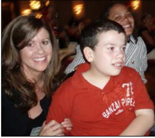
Happy Conference faces...