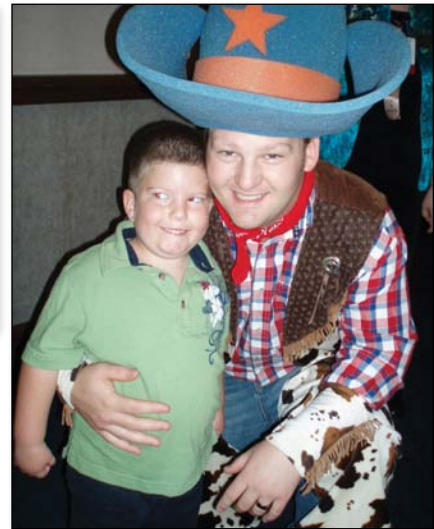
Wild Willy makes a friend