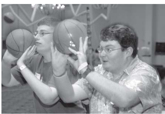
Like Whit Park and Abbot Philson, PWSA (USA) keeps the Research target in sight: We're Hungry For A Cure!

In 2005 mailed 63,672 educational materials on PWS plus 18,000 copies of our educational newsletter and 1,400 free Medical Alert booklets.